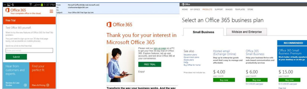
Office365 - Shift to PC quickly