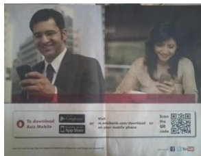
Axis Bank - Just one QR code is enough