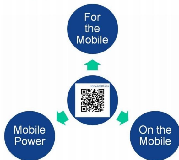
QR360 Framework - Mobile plays centerstage